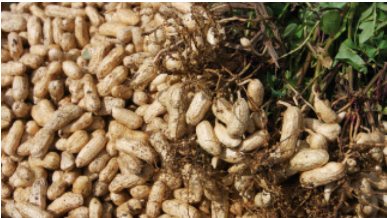
*Data is based on a peanut field trial conducted in 2016